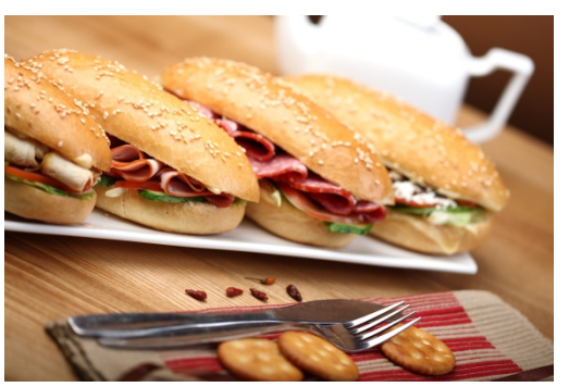
Catering. Cafe. Bakery.